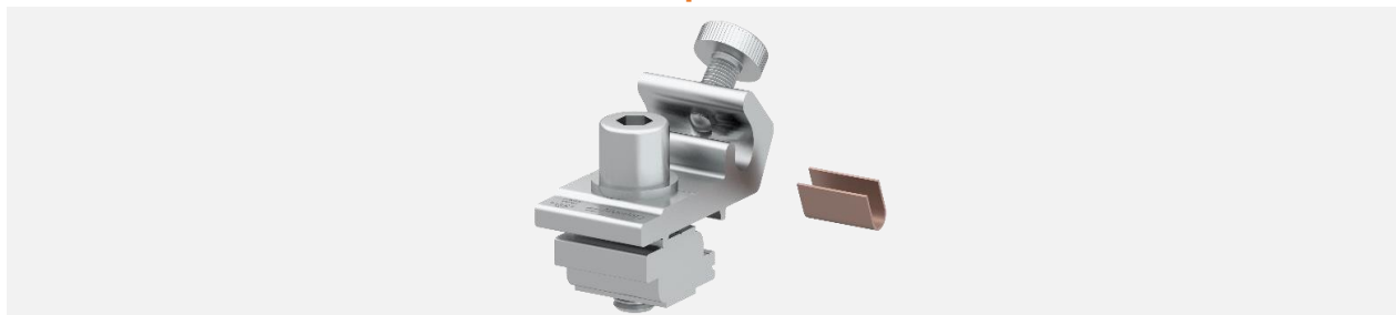
Grounding Lug, with Clenergy Logo, with U-Shape Copper Channel Part No.: EZ-GL-ST/UC (bar code:13-14030-037)