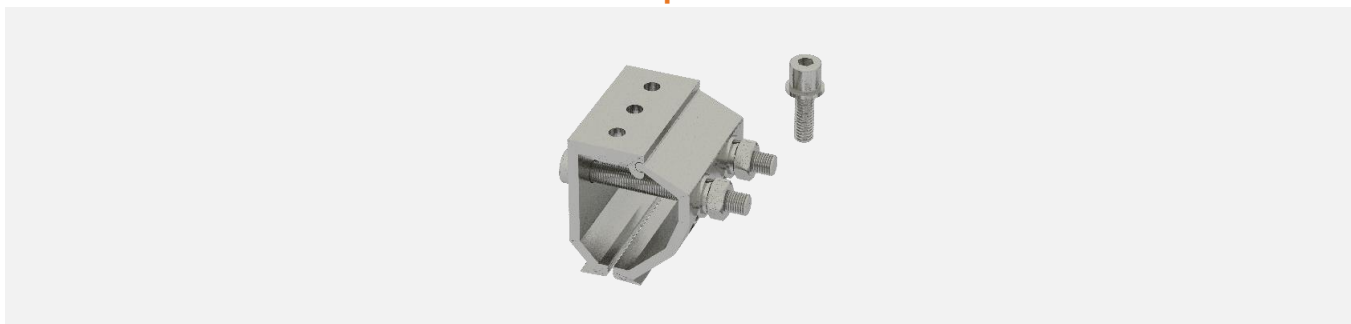
Universal Klip-lok Interface