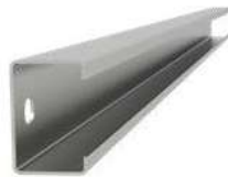
R-C80/40-P Rail & Girder