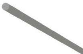
ER-TR-P Tie Rod