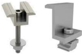
ER-EC-N & ER-IC-N/U18 End Clamp with nuts & Inter Clamp with nuts