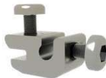
EZ-GL-U Grounding Lug