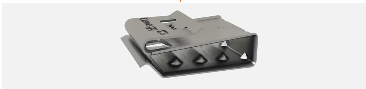
Universal Cable Clip for PV Panels for holding 4 cables