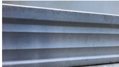
Figure 2: After 6 years