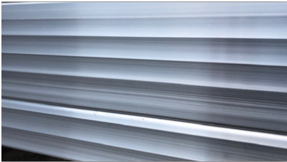
Figure 1: After 1 day

R-ECO/4XXX/AUMF is a non-anodized product. We warrant this product, and 'The Cutter Rail' will maintain its structural integrity throughout its design life when installed, in accordance with the Clenergy Installation guide.