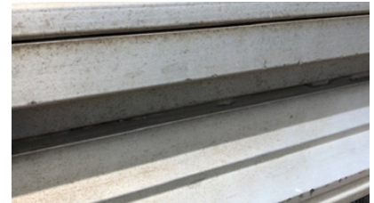
Figure 3: After 21 years

The above examples were exposed to C4 category corrosion levels and were in contact with highly contaminated products. In addition, there were no surface treatment or regular cleaning through its lifespan.