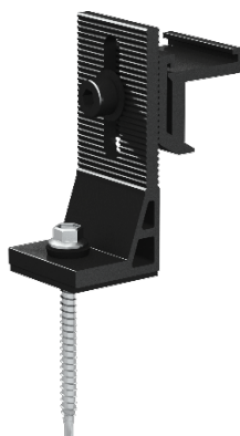
Tin Interface A with ezClick connection, Black Anodized Part No.: ER-I-05A/EZC/ECO/BA (bar code:13-12015-201)