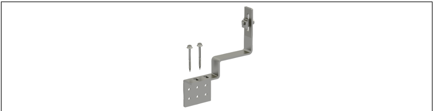
PV-ezRack SolarRoof, Tile Interface, Side Mount Part No.: ER-I-26