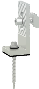
SolarRoof, Tin Interface Part No.: ER-I-05