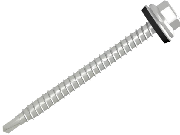
Self-drilling Universal Screw, Buildex 14-11 x 70 Hex Head Zips Climaseal 3 with 16 mm ABW Part No.: US-6.3/70-BW/BX