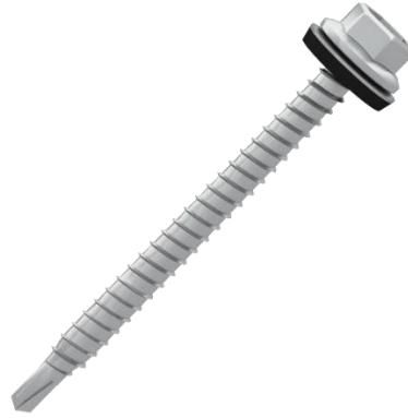
Self-drilling Ponte Screw, Buildex 14-11 x 70 Hex Head Zips Climaseal 5 with 16 mm ABW Part No.: US-6.3/70/C5-BW/BX (bar code: 13-14011-064)