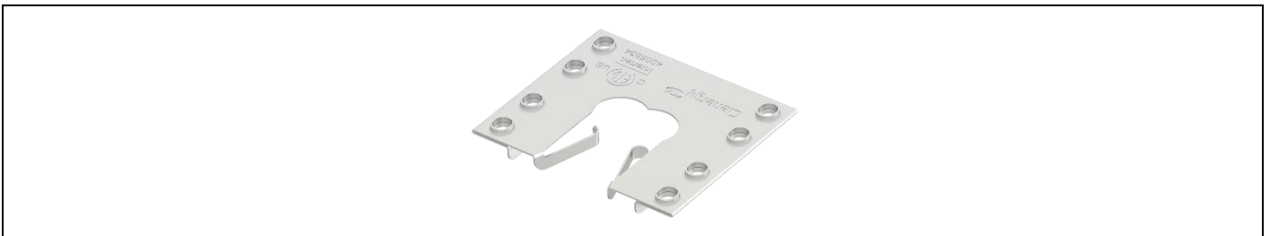
Grounding Clip, with Clenergy Logo Part No.: EZ-GC-ST (barcode: 12-023-00003)