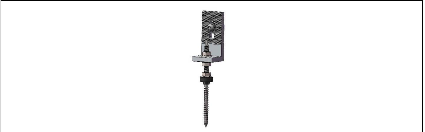
Tin Interface with Hanger Bolt M8x150 for wood purlin, with W module 2 Part No.: ER-I-05/HB/WP/W (bar code: 12-011-00894)